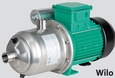
Wilo MP Non Self-Priming