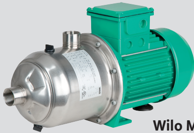
Wilo MC Self-Priming