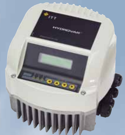
Pump Mounted Variable Speed Controller