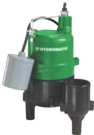
Wide angle float operation available