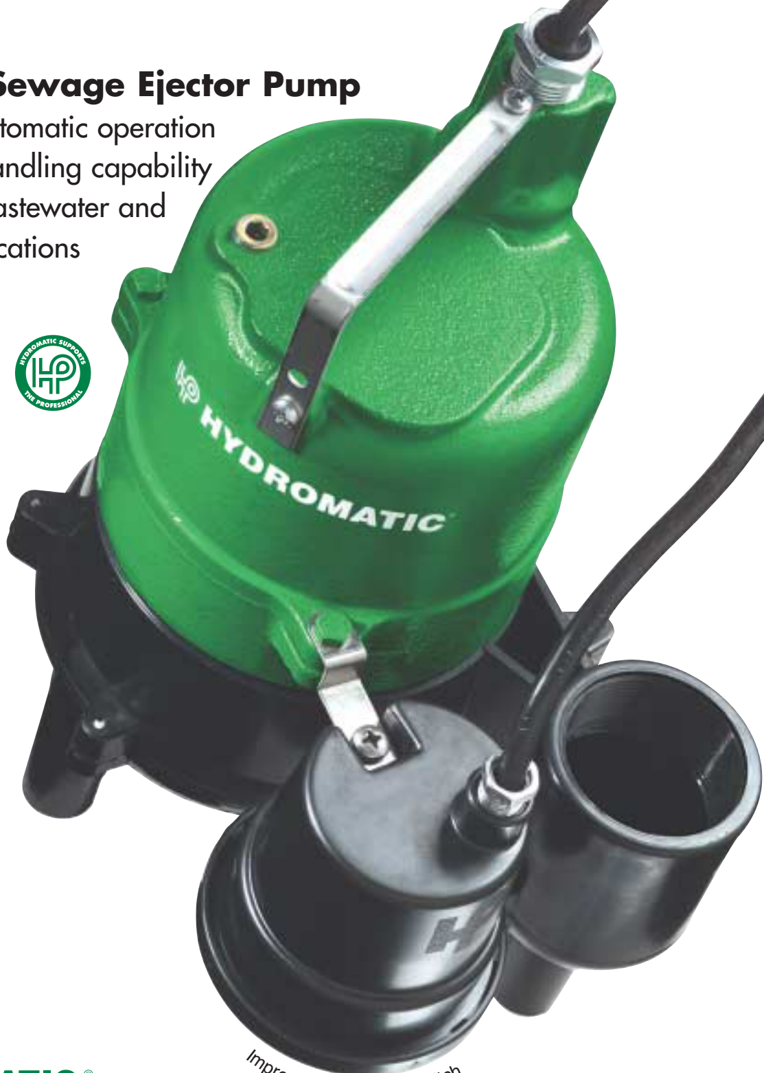
Improved Diaphragm Switch