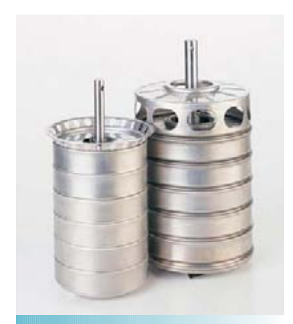
Replacement Stacks and Repair Kits are available for immediate delivery and installation, saving on unnecessary downtime.