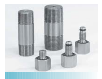
Accessories are available from Berkeley to support your application needs, including 316 SS By-Pass Orifices, Suction & Discharge Gauge Adaptor Kits and Companion Flanges.

With a diversified line of products and accessories to choose from, you can easily customize the pump that's right for you.