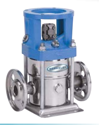
Model BVMI & BVMX – 304 SS and 316 SS construction available in victaulic and flanged connections.