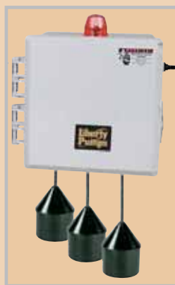
SXH24=3 Control Panel with Alarm Included