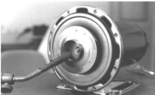
FIGURE 4 – Heat impeller hub to break adhesive bond.