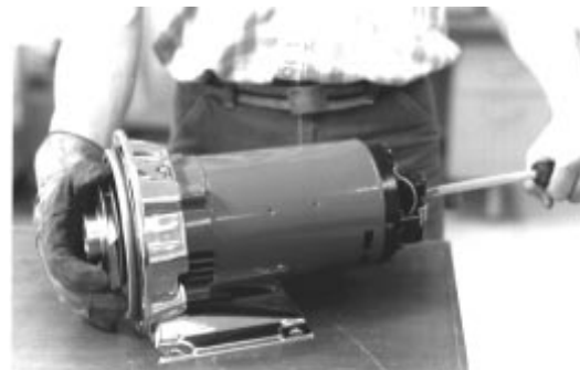
FIGURE 5 – Remove impeller.

For further information, contact ITT Bell & Gossett, 8200 N. Austin Avenue, Morton Grove, IL 60053, Phone (847) 966-3700 – Facsimile (847) 966-9052.