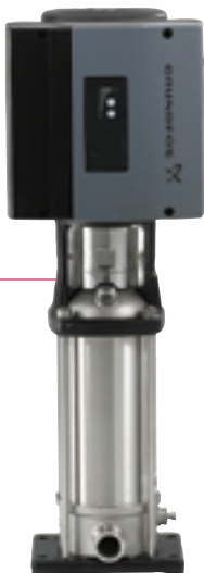
The Grundfos CR/CRE pumps have been engineered for maximum efficiency and reliability. These advantages are incorporated into Grundfos BoosterpaQ systems.

All components have been combined with focus on quality and efficiency. Grundfos BoosterpaQ systems are designed to last: sturdy, compact units with easy access to all service parts.