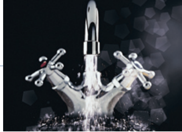
The Grundfos Hydro MPC booster system ensures proper and constant water pressure at all times.

Grundfos BoosterpaQ systems can be used wherever additional pressure is needed. Each booster model has been designed to meet the customer's specific needs and requirements for capacity and control.