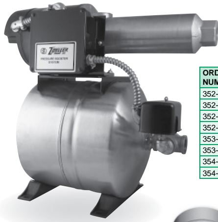
Model 353 shown