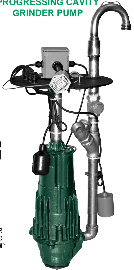
Product may not be exactly as pictured.